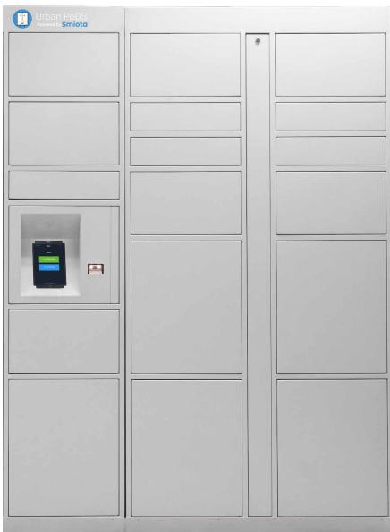
Console with 12-door, full bank add-on

To learn about Smiota Smart Locker use cases and applications, visit www.smiota.com .